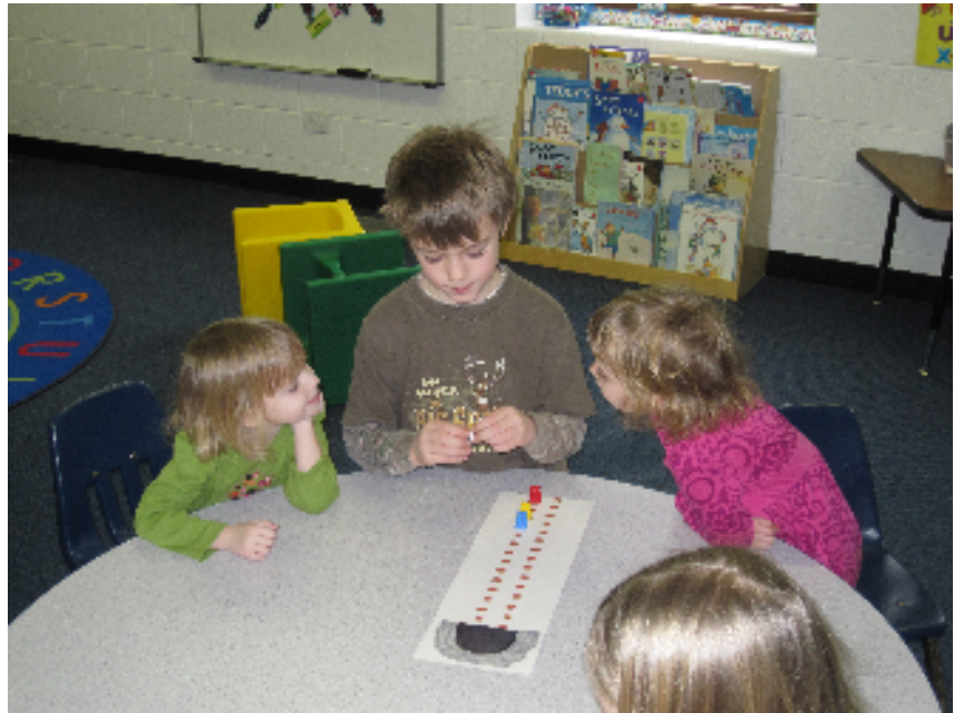
Playing a math game with our preschool friends.